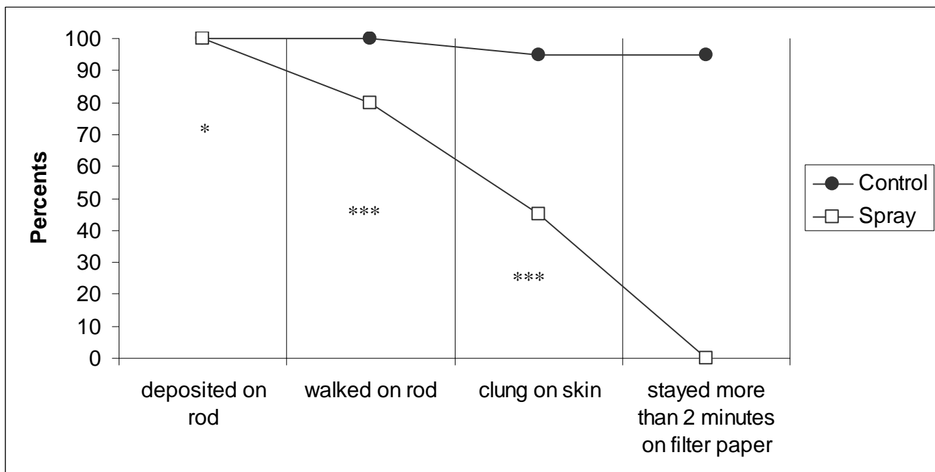
Figure 2: behaviour of ticks at each step of their foraging activity. Stars show significant differences (*: \alpha < 0.05 ; ***: \alpha < 0.001 ).

There significantly less ticks that walk on the tip on the road with the spray treatment ( \chi^2=4.44 , P=0.035 ; Fig 1). Only 45% of ticks caught the filter paper with spray, which is significant too ( \chi^2=11.9 , P<0.001 ). Finally no ticks stay more than 2 minutes on the attachment site, which prove the high efficiency of the product ( \chi^2=36.2 , P<0.001 , Fig 1).